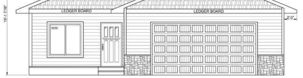
FRONT ELEVATION 1/8" = 1'-0"