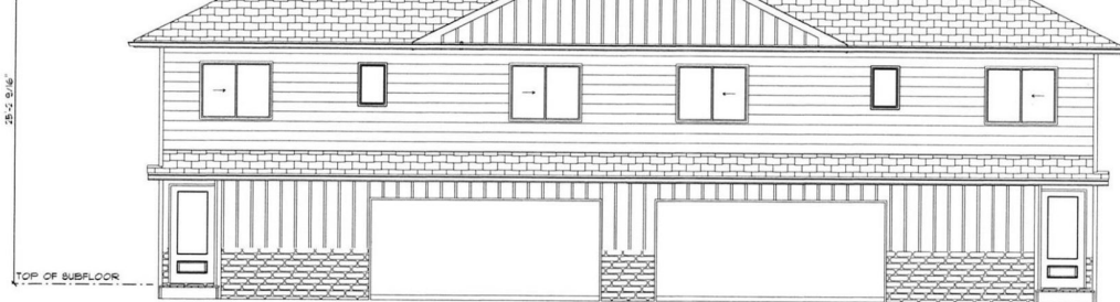
FRONT SCALE: 1/8" = 1'-0"