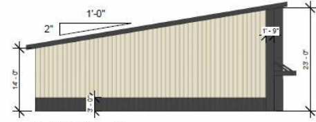
① East (Building 1) 1/16" = 1'-0"