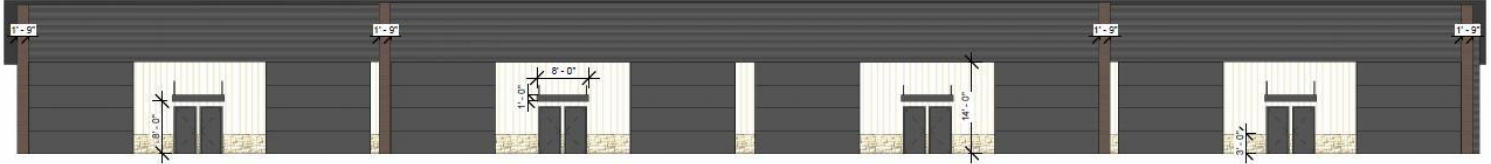
② North (Building 1) 1/16" = 1'-0"