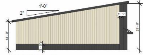
① East (Building 1) 1/16" = 1'-0"