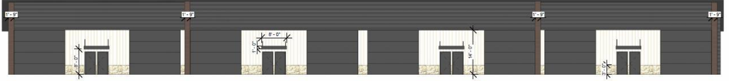
② North (Building 1) 1/16" = 1'-0"