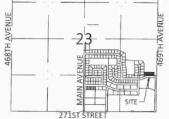
VICINITY MAP SEC 23, T100N, R51W